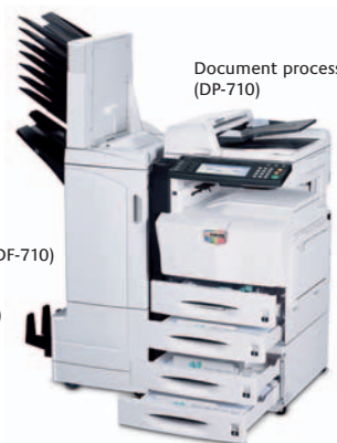
Paper feeder (PF-710)

Product depicted includes optional extras